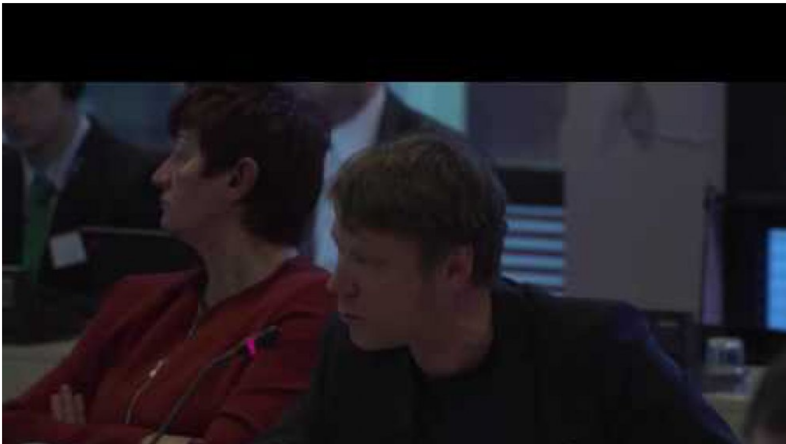
Konferenz "Gerechter Übergang"/Conference - "Just Transition" 1/4

The conference has been filmed, all videos can be found hereunder: