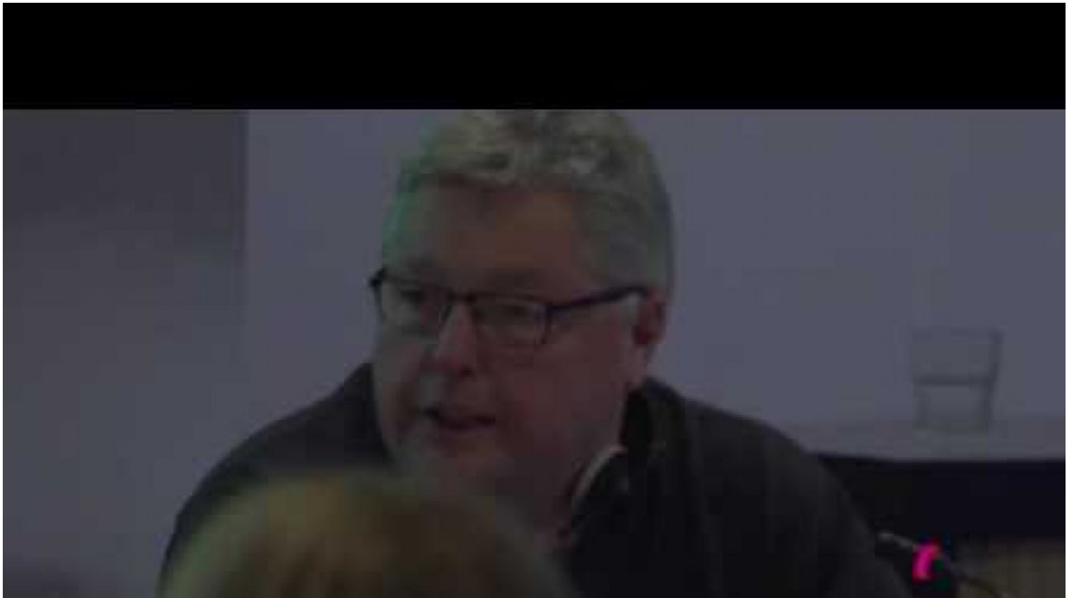
Konferenz "Gerechter Übergang"/Conference - "Just Transition" 3/4