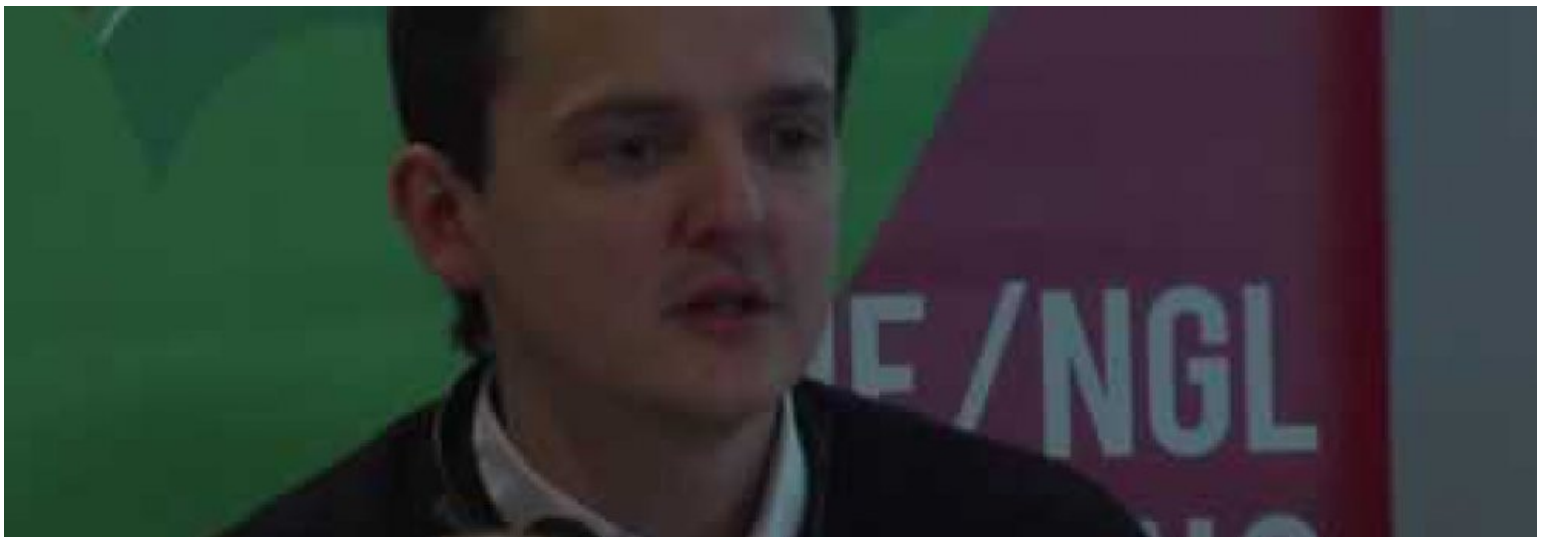
Konferenz "Gerechter Übergang"/Conference - "Just Transition" 2/4